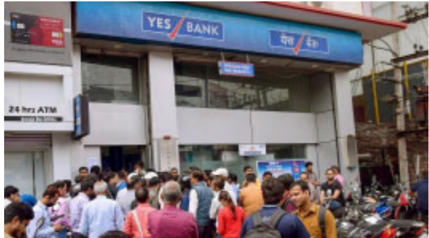
New Delhi: GNS News Agency, March 9

Shares of Yes Bank on Monday zoomed over 30 per cent after State Bank of India (SBI) said it will pick up